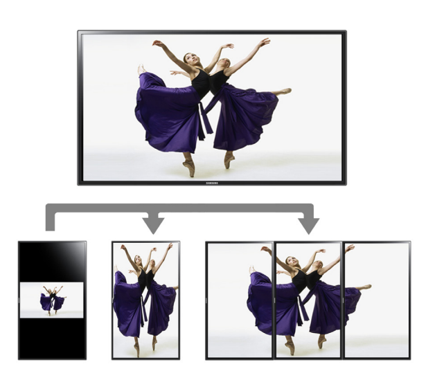
Figure 4. Portrait to landscape image rotation enhances usability with no loss of resolution.

UEC Series displays offer pivoting capability and image rotation software that can change image orientation from portrait to landscape for greater display flexibility. For convenience when rotating images, two ratio options are available: original ratio or auto full-sizing ratio. Users do not need to rotate a picture in the software to make it appear correctly in a different orientation.