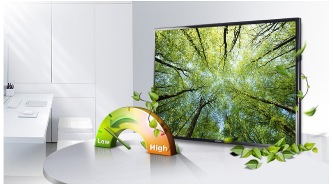
Figure 2. Samsung LED backlight technology uses less power for optimal energy efficiency.

Edge LED technology is mercury free and produces less heat than traditional LCD technology. Samsung technology also offers a dimming solution that generates deeper black tones by controlling the LED BLU (backlight unit). Based on internal Samsung testing, LED BLU technology consumes an average of 30 percent less power than cold cathode fluorescent lamp (CCFL) LCD technology.